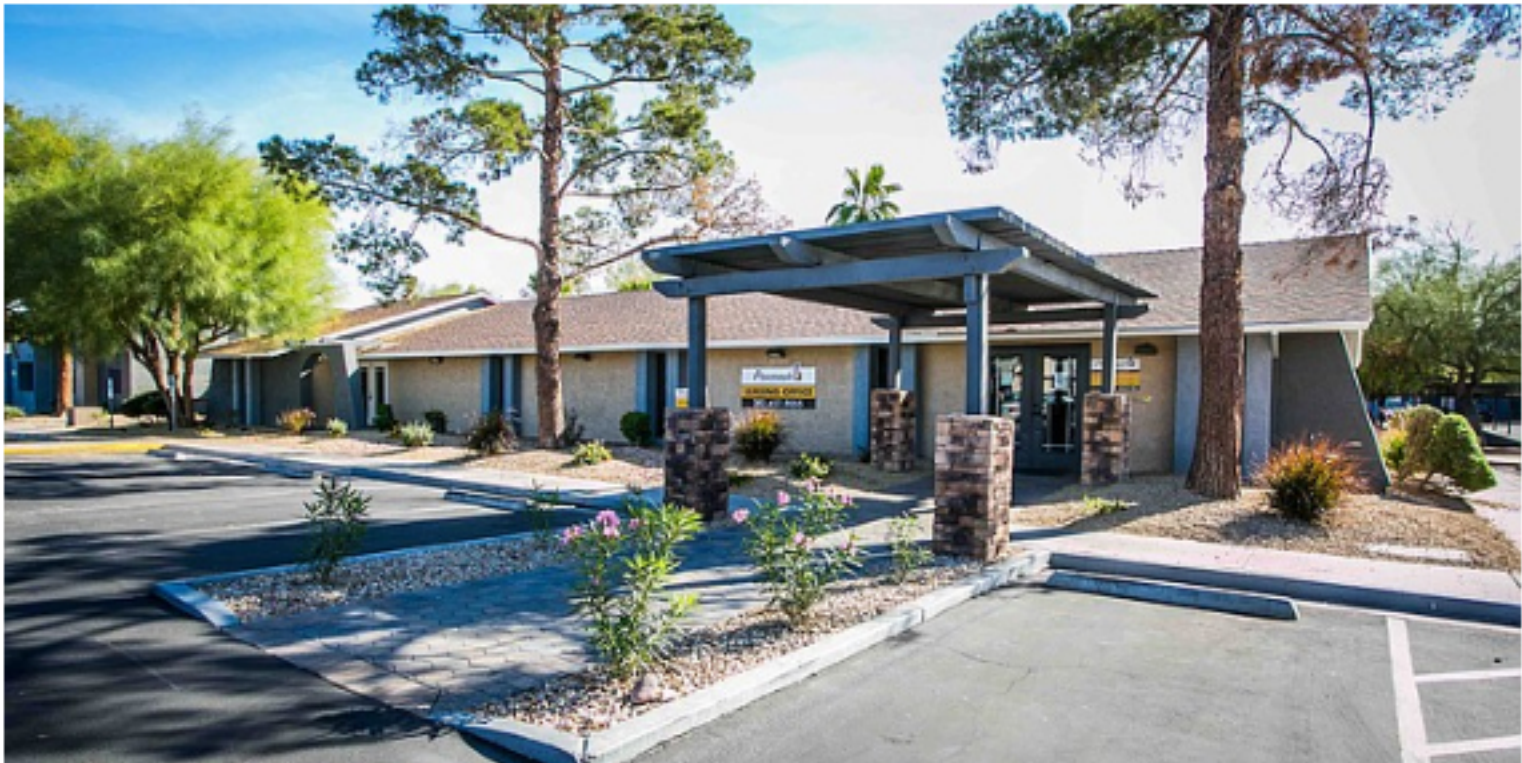
Five89 Apartments

Tower 16 Capital Partners based in Carlsbad has acquired a Las Vegas apartment complex for $32.5 million in a joint venture with Henley Investments.